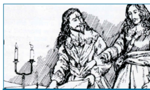
King Charles I and Prince Rupert at the Governor's House.