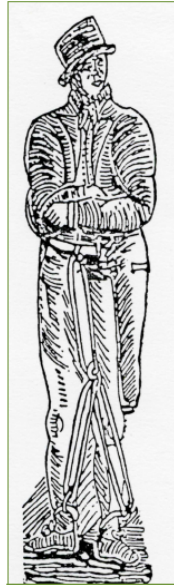
'Nevison in Chains' from The History of Noted Highwaymen , published anonymously in 1700

In the 17th century the notorious Highwayman, John 'Quick Nick' Nevison had his HQ in a back room at the Clinton Arms.